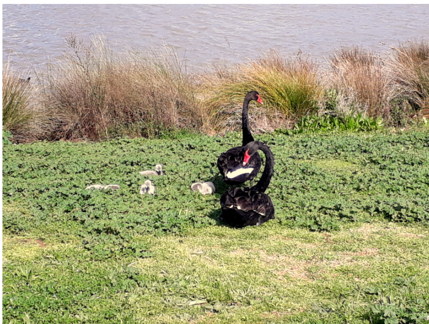
These beautiful Black Swan parents and their cygnets were having family time in a pondage area off Skeleton Creek, Tarneit.